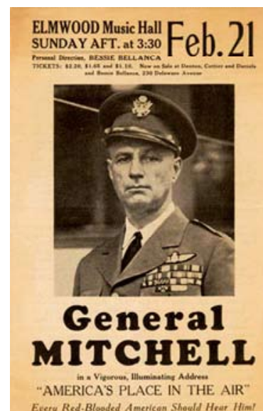
Mitchell speaking tour advertisement

Mitchell resigned effective February 1, 1926 and immediately embarked on a coast-to-coast lecture tour showing films of the ship bombings and continually expressing the need for military preparedness in the air. He called attention to the rapid strides being made in aviation in Europe and Asia and warned of Japanese plans to seize Hawaii, the Philippines and Alaska. His sweeping charges appeared in major American magazines and aviation journals but eventually the public's interest in Mitchell waned and his influence diminished.