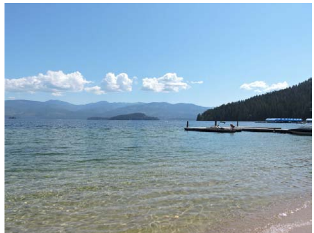
Priest Lake, Idaho