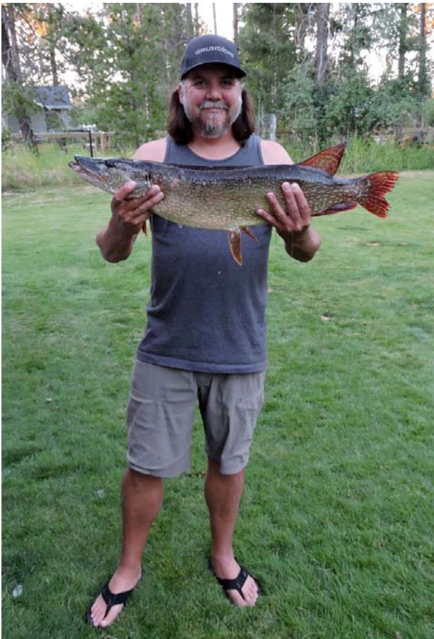
The day's trophy: a 33 inch Northern Pike

Pictures cannot capture the beauty, comfort and joy of the area.