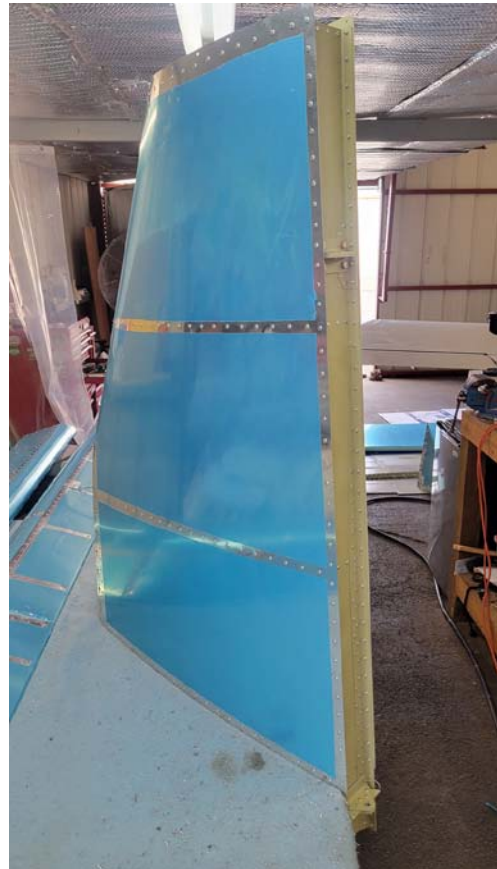
Completed vertical stabilizer

Within a week the empennage began to take shape, with the vertical stabilizer and rudder corrosion-proofed, assembled and riveted together: