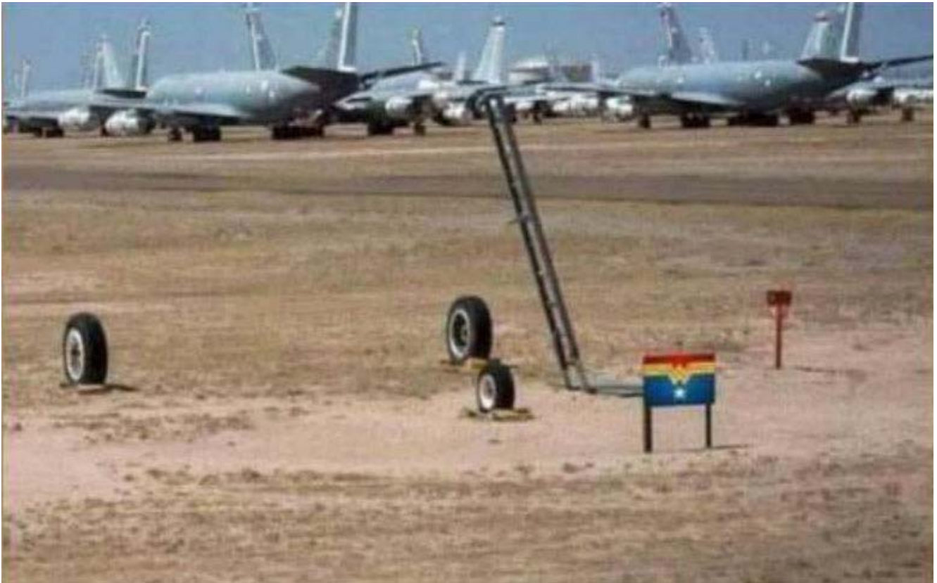
The Air Force displays its newest stealth technology