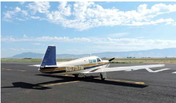
Refueling at La Grande