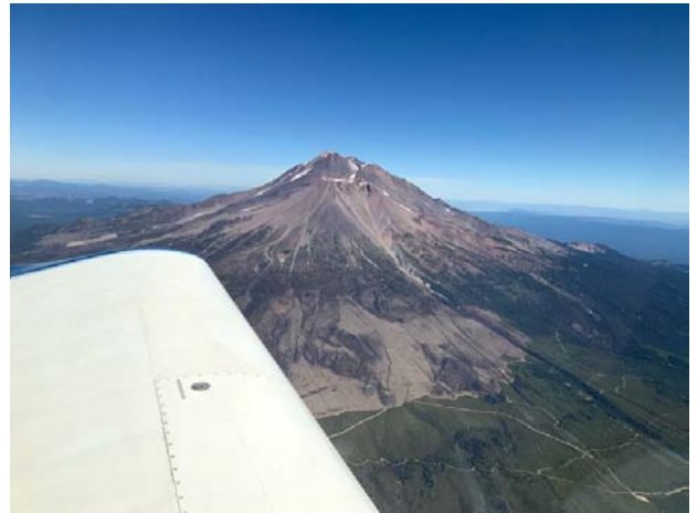
Mount Shasta passes the wing at 11,500 ft.