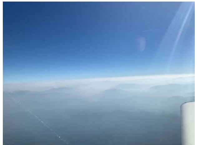
Wildfire smoke covering the Oregon Cascades near the Rogue River valley.

It took about two hours to load all of the empennage kit pieces on the ramp at Vans.