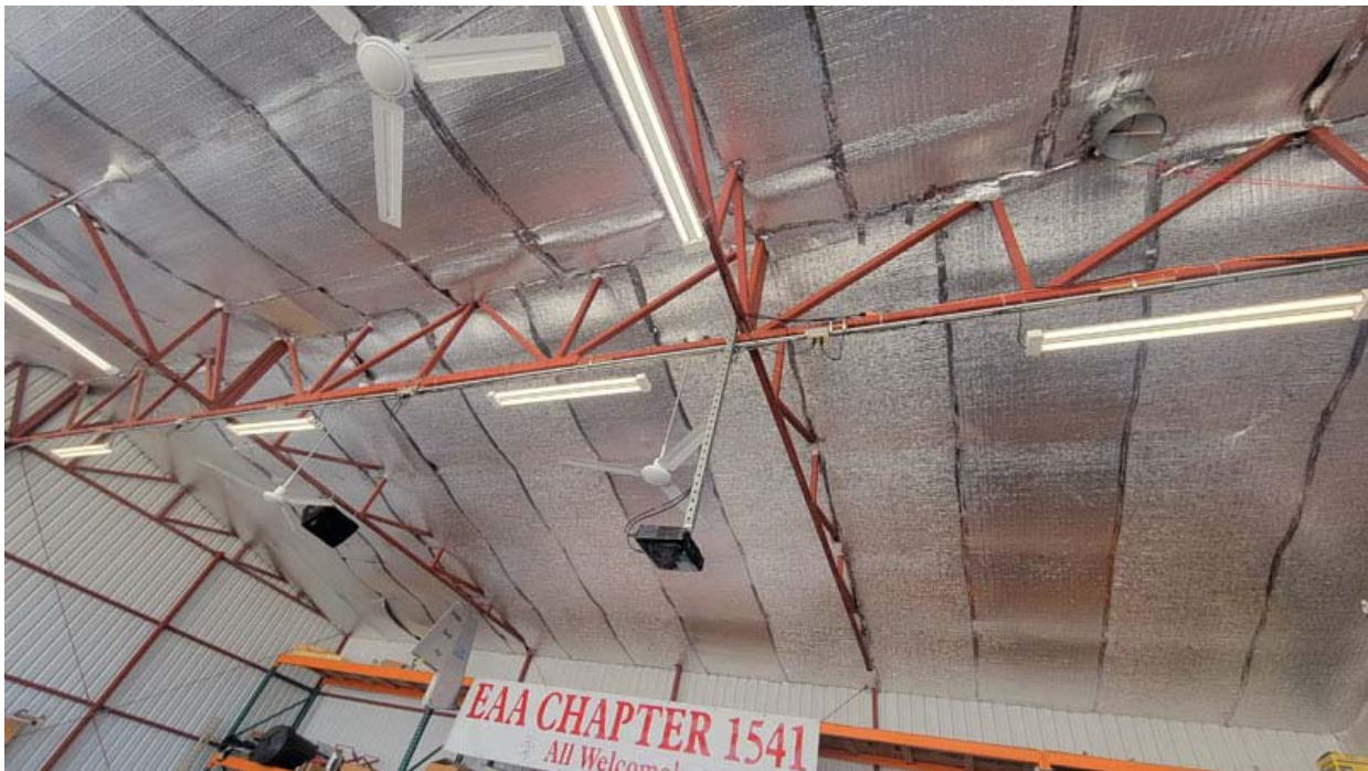
No more drooping ceiling insulation!