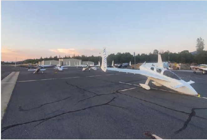
On the ramp at Columbia