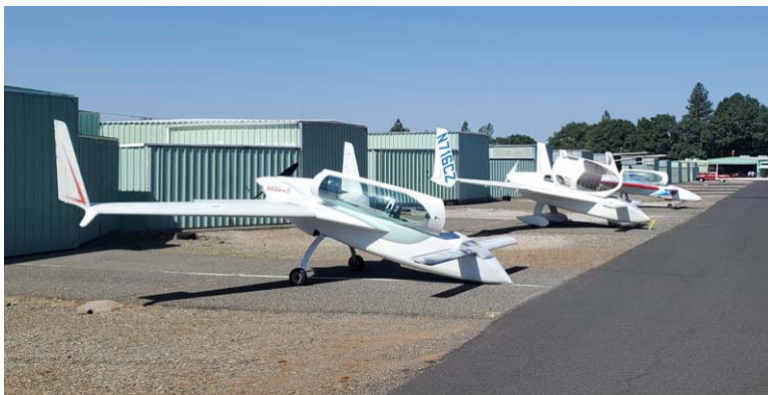
Canards grazing at Placerville before departing for Columbia

After adding enough fuel to get through the three short flights of the weekend, I departed Watts-Woodland to the south, climbed to 500 ft and banked right to get on an easterly heading. The Sacramento Class C airspace was only 4 miles ahead, so I picked up NorCal approach at 500 feet and