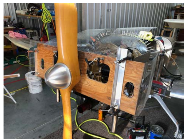
Revmaster engine mounted