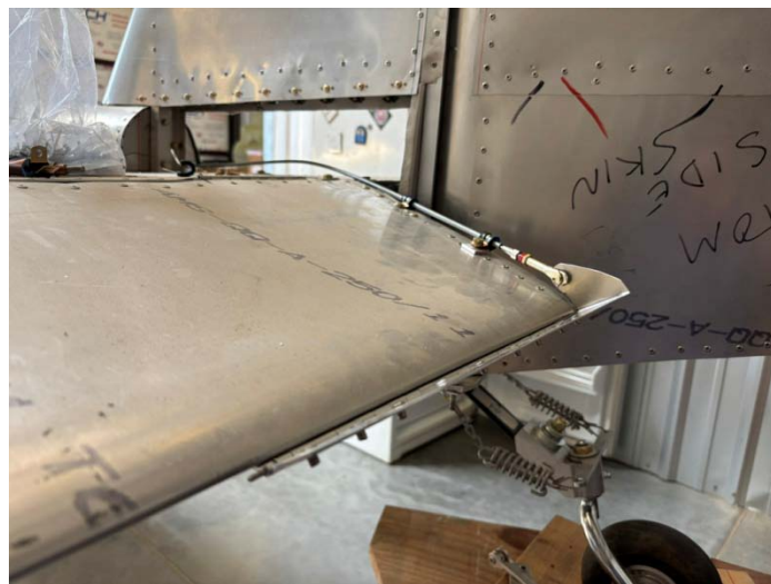
Elevator trim tab