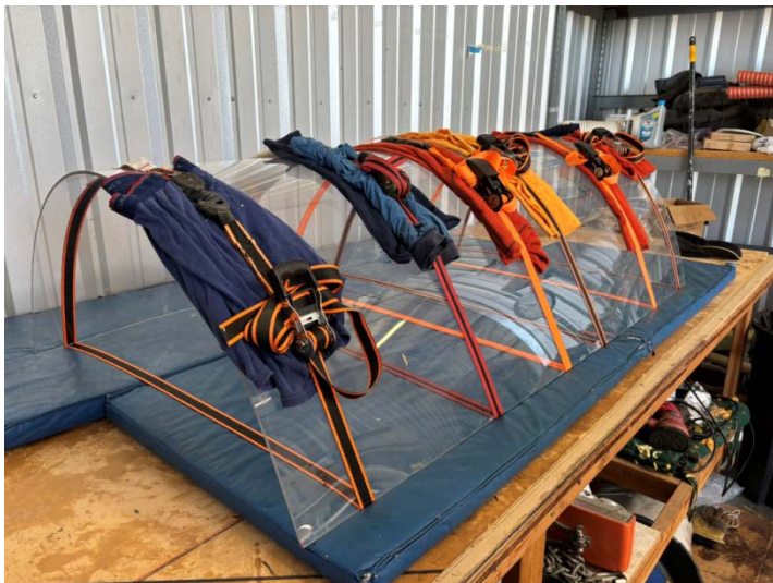
Bending acrylic for the canopy

It is located at Mark Weitkamp - Experimental Aircraft Builder's Log and will tell you much more than you ever wanted to know about building a plane from plans.