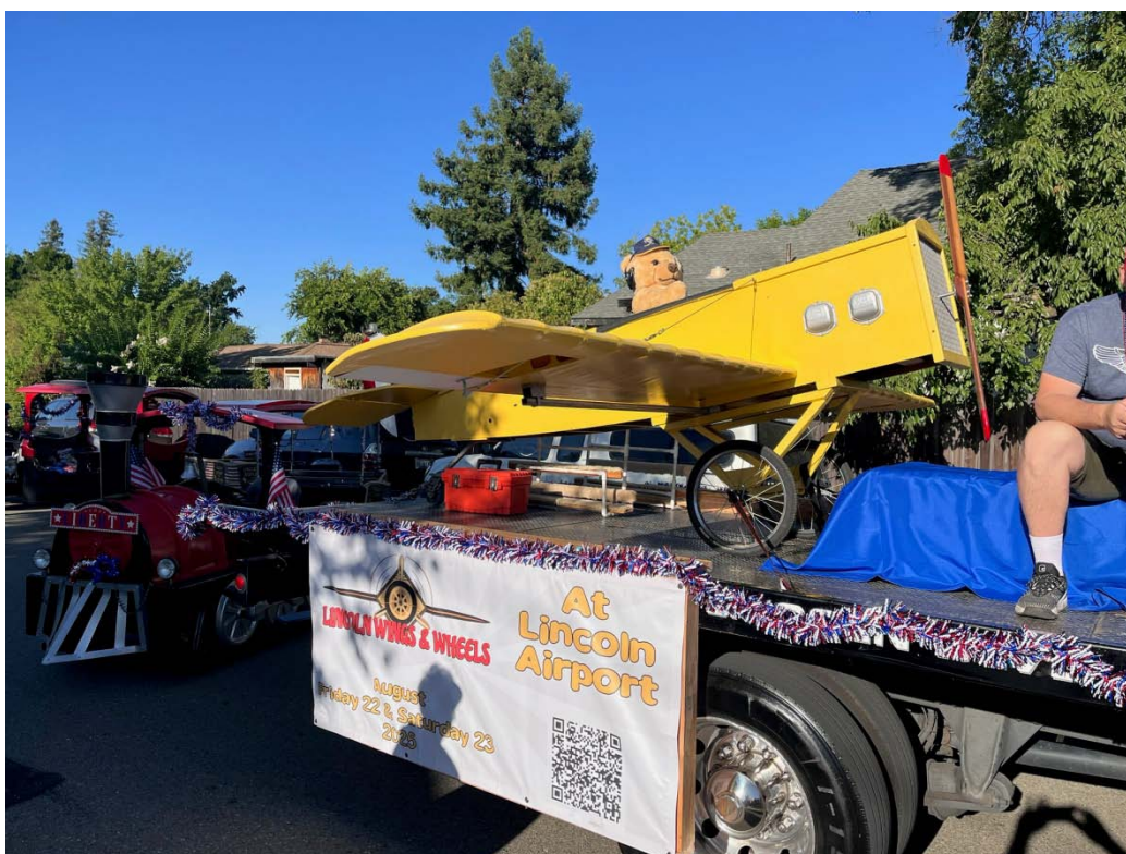
EAA 1541's yellow kiddie plane in the Lincoln 4 th of July parade. The bear flying it is only an honorary member of the chapter