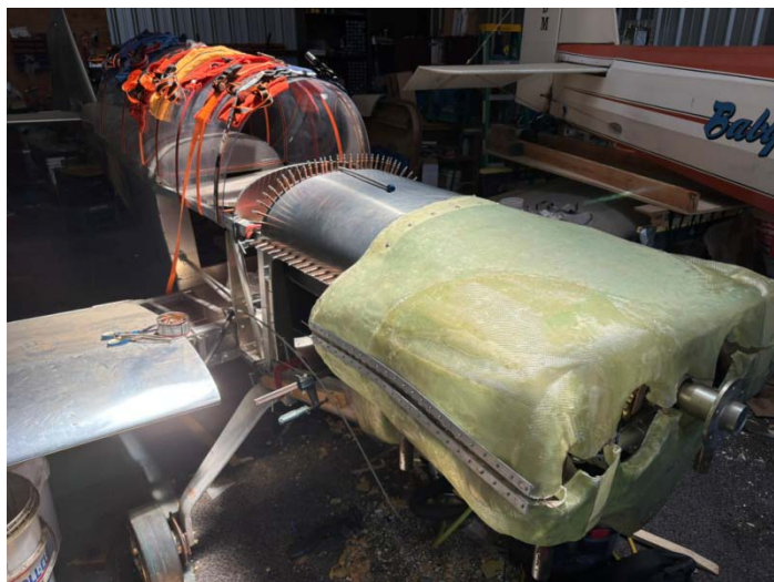
Progress on fiberglass engine cowling