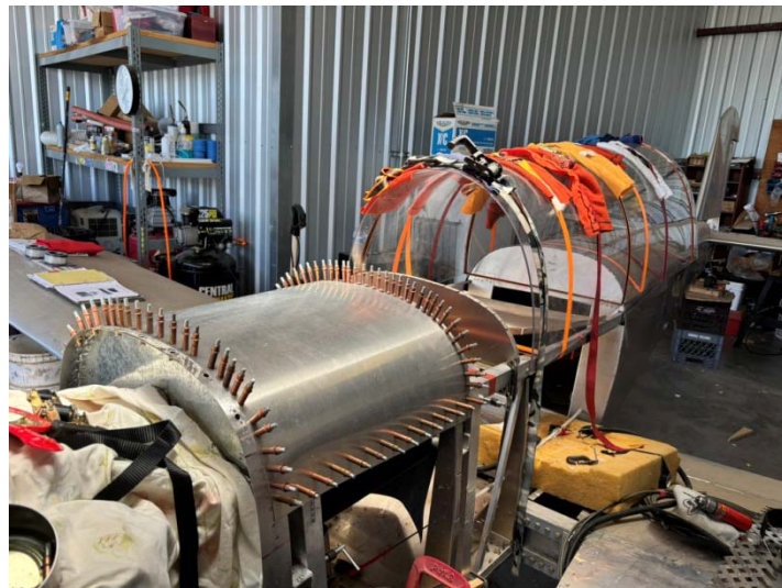
Attaching it to the fuselage