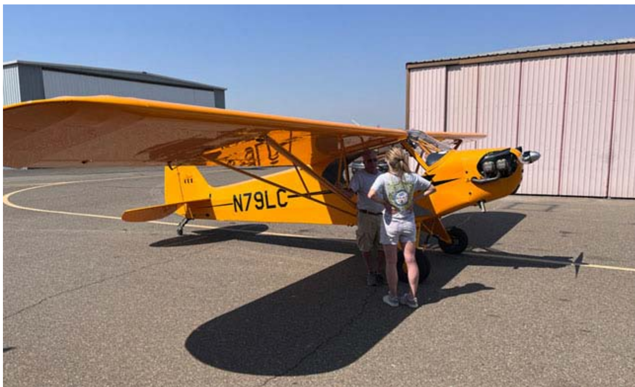
Bruce's Legend Cub was on display at our gathering on July 12.