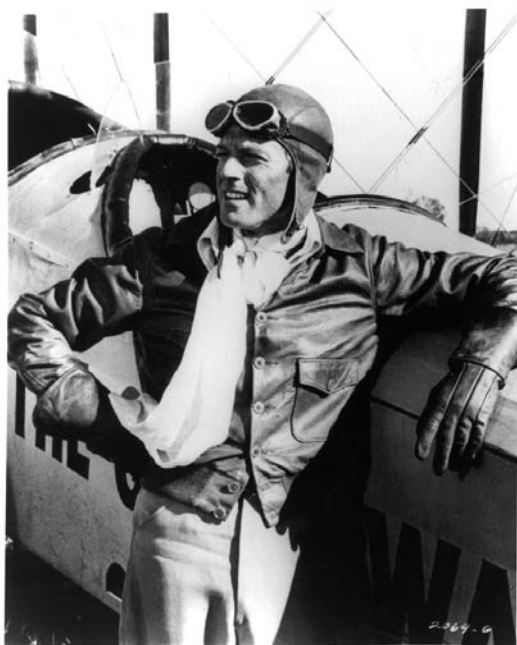
Robert Redford, daredevil flying ace in THE GREAT WALDO PEPPER

A quick review of the storyline highpoints: an early aviator, Waldo Pepper (played by Redford) learns to fly at the end of World War I but misses his chance of combat with the top German ace. He becomes a barnstormer but eventually runs afoul of new government regulations and is grounded. He soon enough becomes a movie stunt pilot on the sly, and finally gets his chance at aerial combat with that German ace. Some exciting aerial action ensues. It's a good story with some good actors. Besides Redford, there is a young Susan Sarandon and Bo Svenson, plus a host of others.