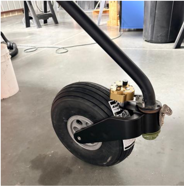
failure from the early kits.

Now that the weather is warming up, I made the plenum and runners for cooling air from the roof NACA ducts.